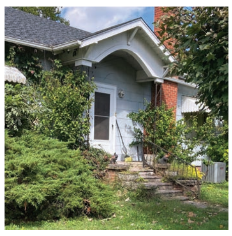
Help ASP build Joe a ramp!