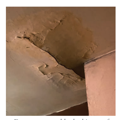
Damage caused by leaking roof

*Name changed to protect family's privacy